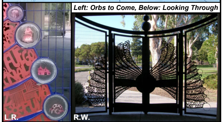
Left: Orbs to Come, Below: Looking Through