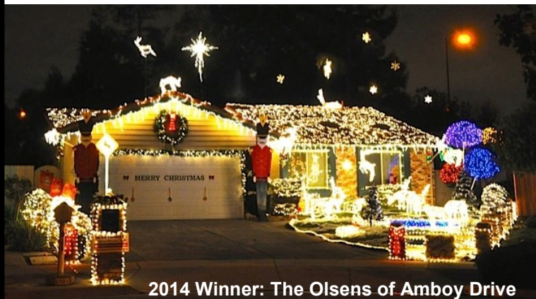
2014 Winner: The Olsens of Amboy Drive

A VEP e-mail alert will go out prior to Christmas, indicating the winners, so that you, your family, and visiting friends and relatives, can drive (or walk) around the VEP neighborhoods enjoying the spectacular decorations our neighbors put up for all to enjoy!