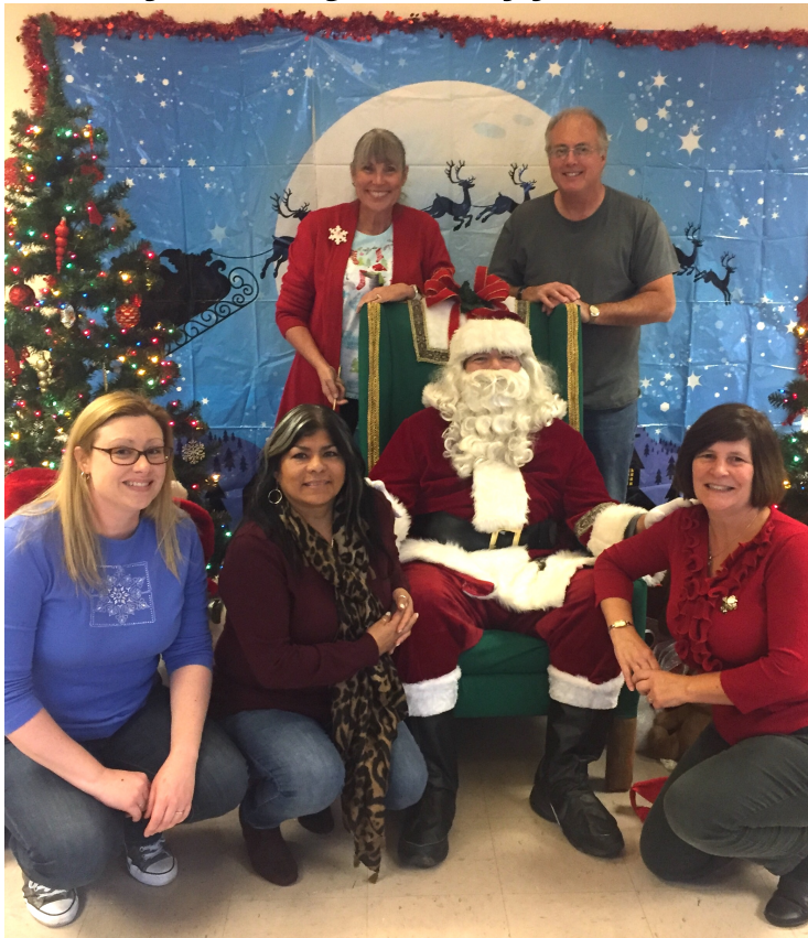
VEP's 12 th Annual "Santa In the Park" (Dec. 2019)

VEPCA wishes your families a joyous and safe holiday season! Many thanks to our members for all your support!