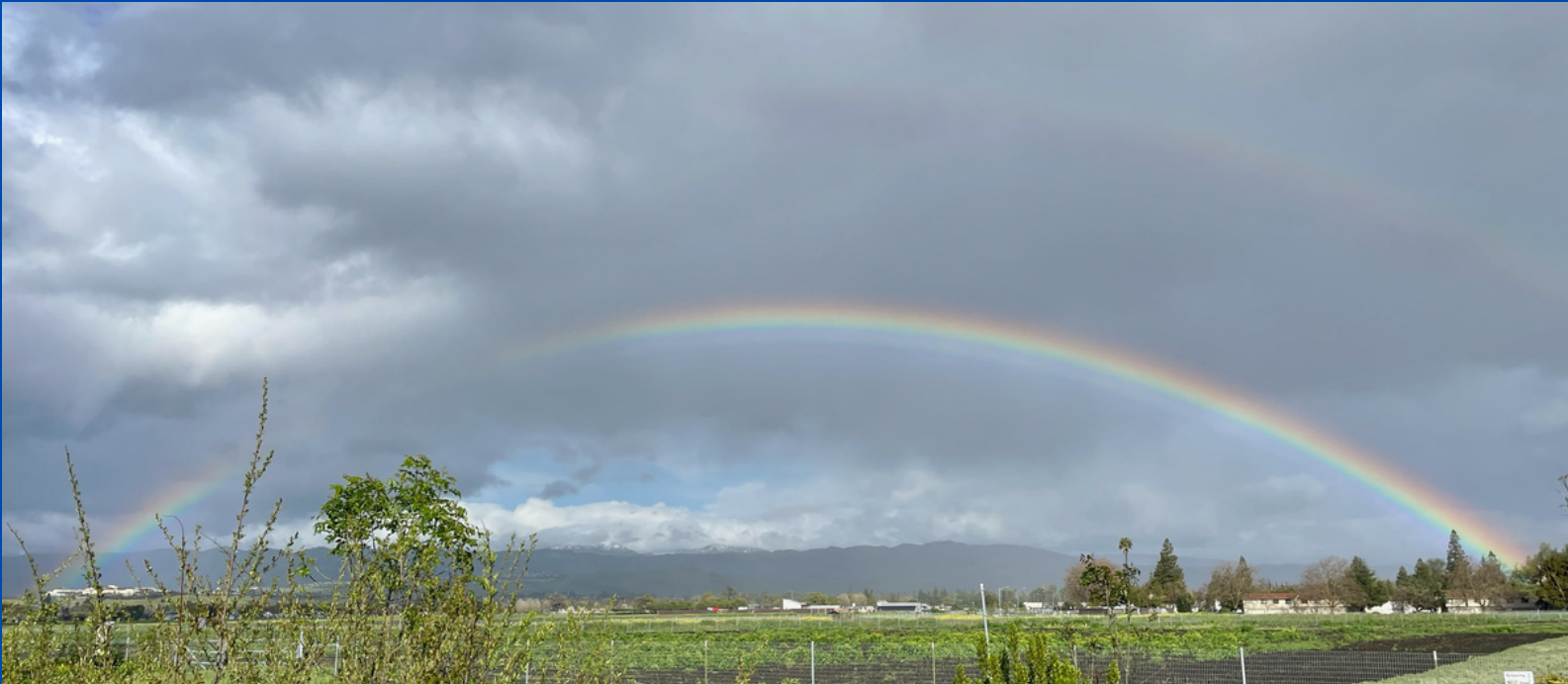
Double-Rainbow over Martial Cottle Park. Photo: Adina Pierce, March 29th