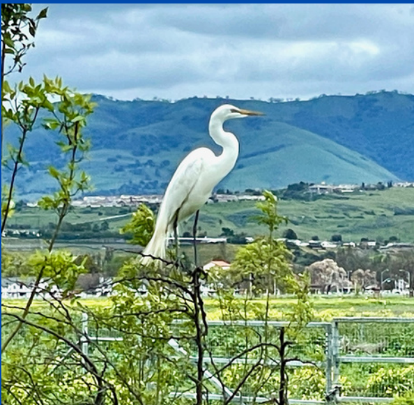
LEFT: Snowy Egret perched in a back yard next to Martial Cottle Park. April 7th