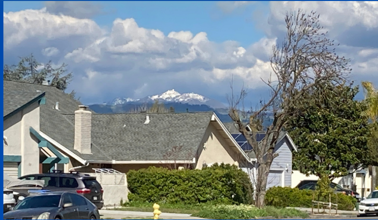
Snow on Mt. Hamilton - Again! View from Bluefield Dr.