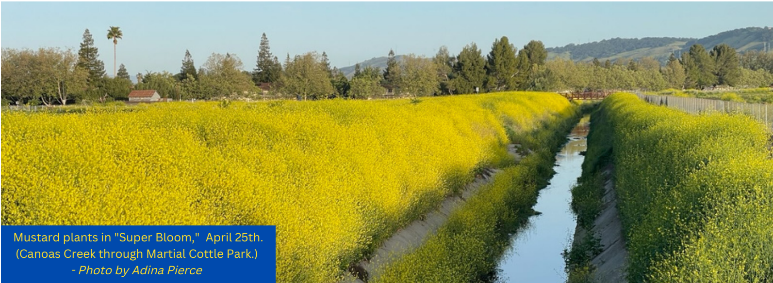
Mustard plants in "Super Bloom," April 25th. (Canoas Creek through Martial Cottle Park.)