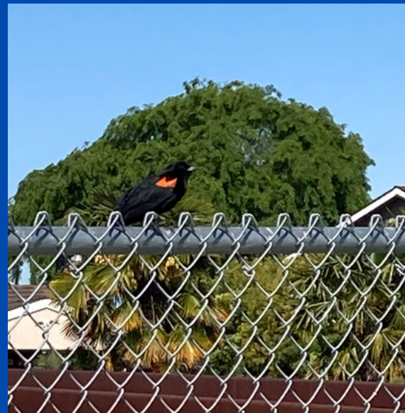
RIGHT: Red-Winged Blackbird at Martial Cottle Park, April 26th